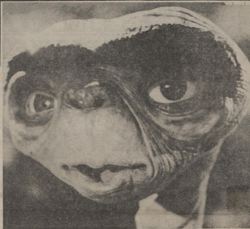
SCREEN ET... but readers claim they've met real aliens

"He was beside a pool containing a sick dolphin. He took my hand